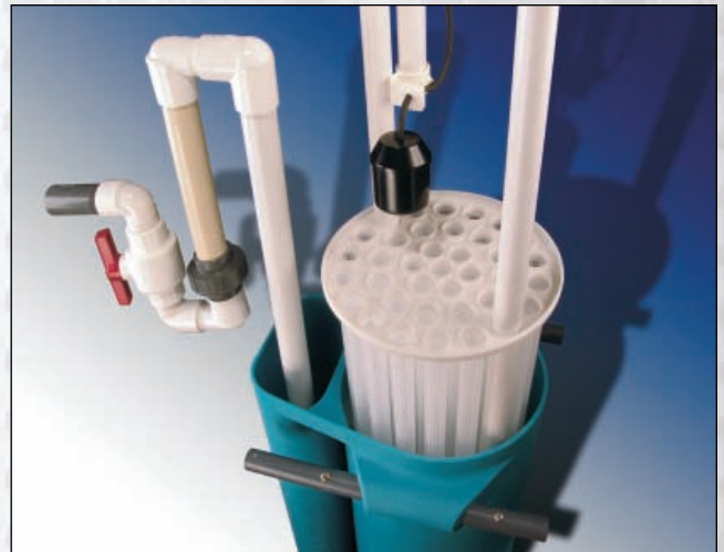
Easy access design

* Covered by U.S. patents 4,439,323 and 5,492,635. Foreign patents pending.